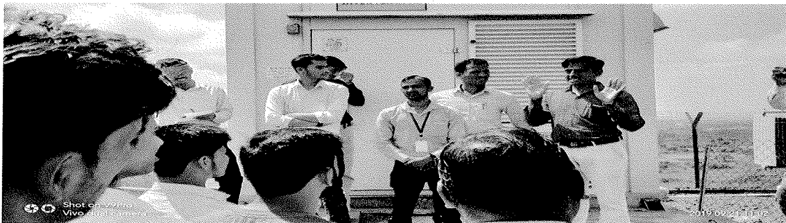
Explain Project to Student

The tour was successfully completed, and it greatly enhanced the students' academic understanding of rural development and historical geography.